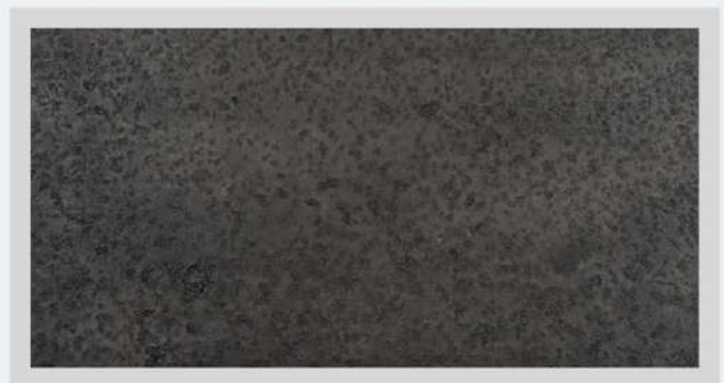
SB28 - SAND BLAST