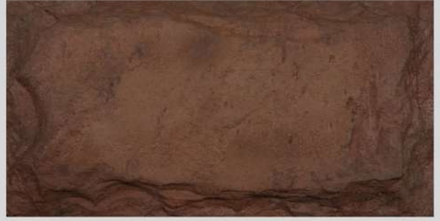
CR01 - CASTLE ROCK

CASTLE ROCK : Hand chiseled rectangular sand stone pieces has create dramatic look of finally dressed rock masonry.