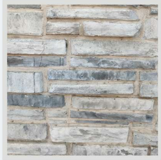
CY02 - CYPRESS LEDGE