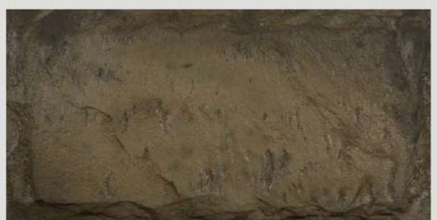
CR09 - CASTLE ROCK