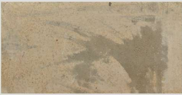
SB03 - SAND BLAST