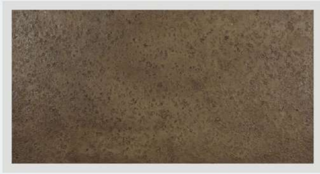
SB12 - SAND BLAST