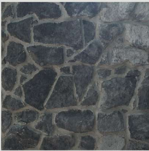
FS03 - FIELD STONE