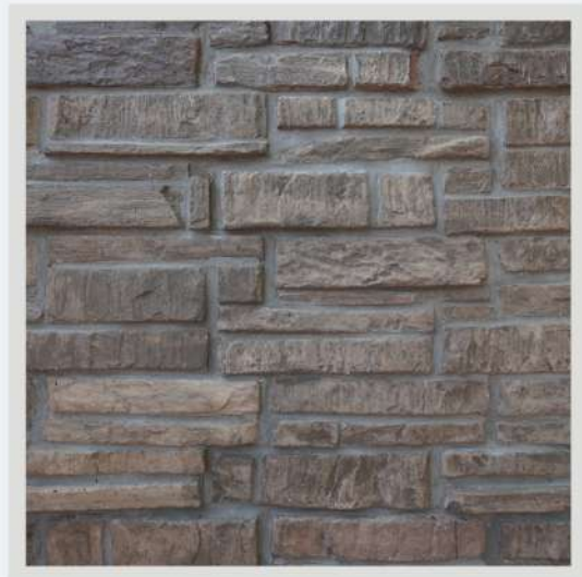
CY04 - CYPRESS LEDGE