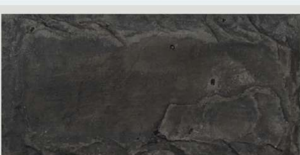
CR18 - CASTLE ROCK