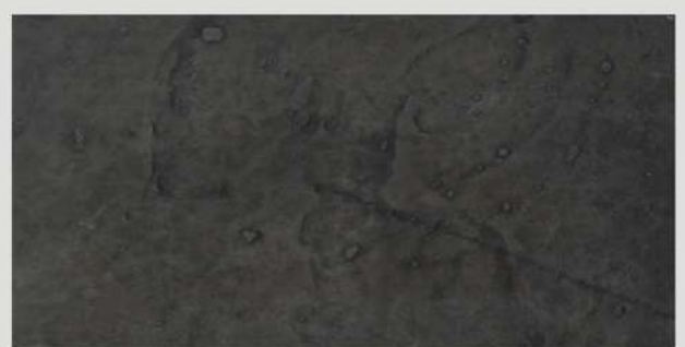
SS28 - SAND STONE