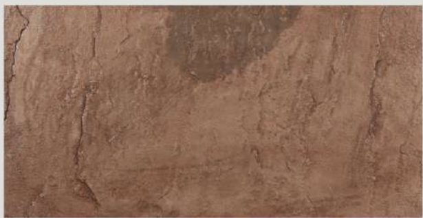
SS06 - SAND STONE