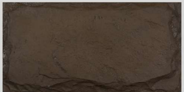
CR07 - CASTLE ROCK