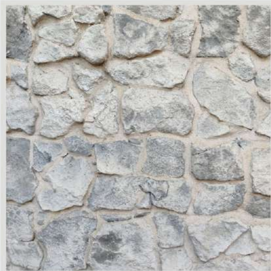
FS04 - FIELD STONE