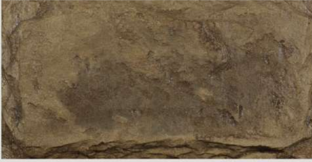
CR10 - CASTLE ROCK