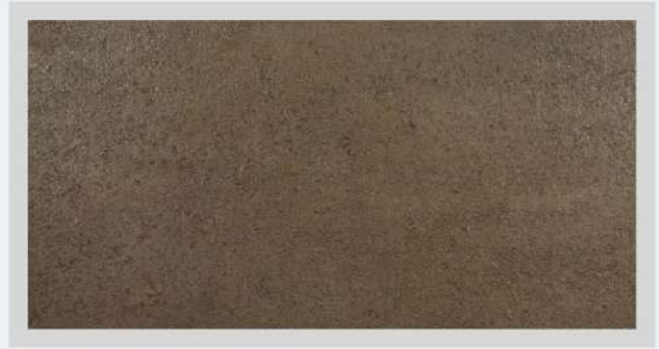
SB10 - SAND BLAST