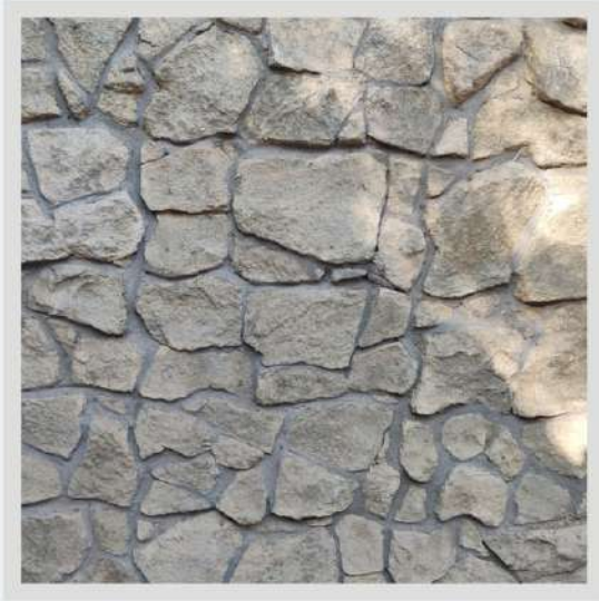
FS07 - FIELD STONE