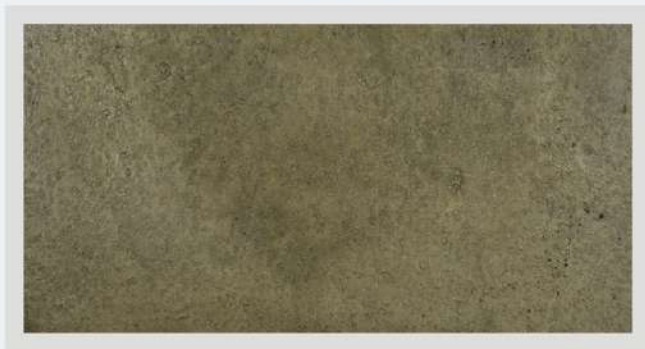
SB24 - SAND BLAST