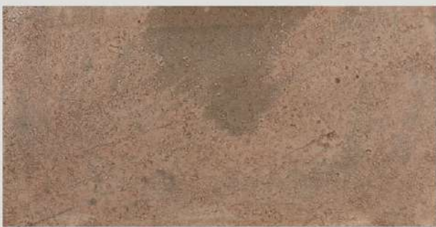
SB07 - SAND BLAST