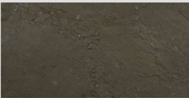
SS23 - SAND STONE