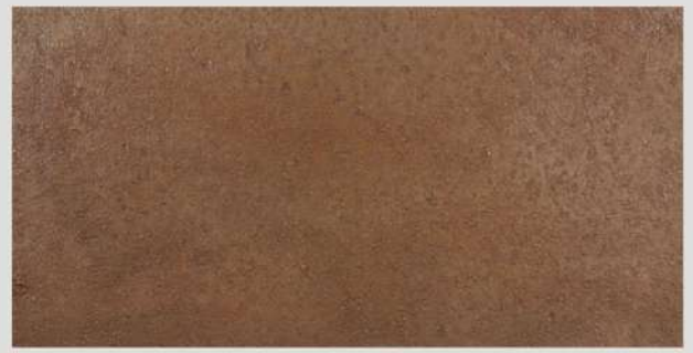
SB04 - SAND BLAST