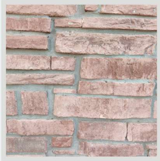
CY01 - CYPRESS LEDGE

CYPRESS LEDGE : Combination of hand chiseled linear pieces of varying shape, colors ,texture andgrouting between every piece of stone gives perfect rustic look for your space.