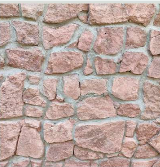
FS05 - FIELD STONE