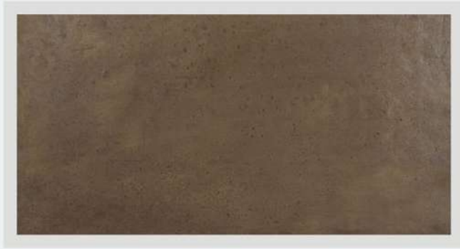
SB09 - SAND BLAST