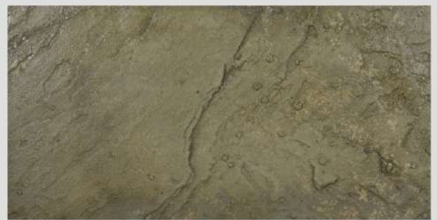
SS24 - SAND STONE