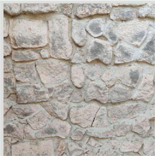
FS06 - FIELD STONE