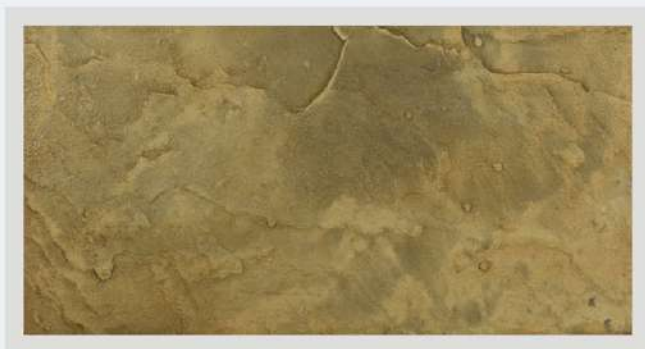
SS15 - SAND STONE