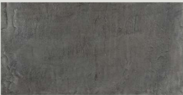
SS25 - SAND STONE