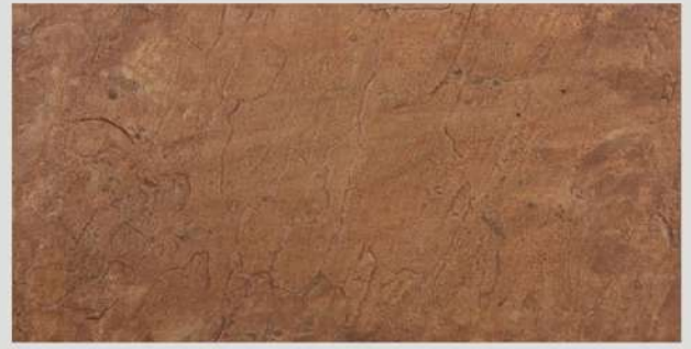
SS01 - SAND STONE

SAND STONE : Well-known for its natural beauty and tonal variation, indian sandstone Paving offers unique colour palettes, subtle veining detail and even some plant fossil..