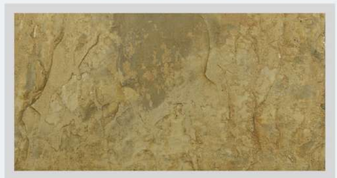
SS16 - SAND STONE