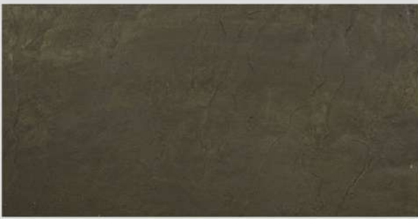
SS21 - SAND STONE