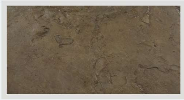
SS10 - SAND STONE