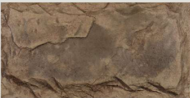
CR06 - CASTLE ROCK