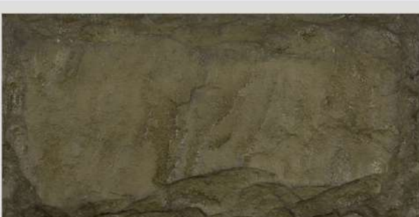
CR16 - CASTLE ROCK