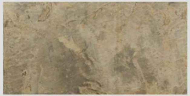
SS03 - SAND STONE