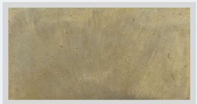
SB17 - SAND BLAST