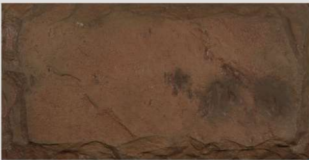
CR04 - CASTLE ROCK