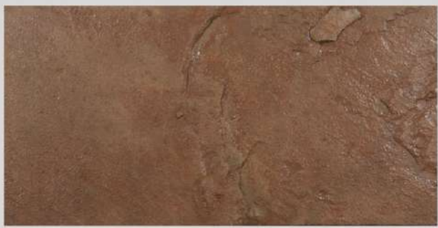
SS04 - SAND STONE