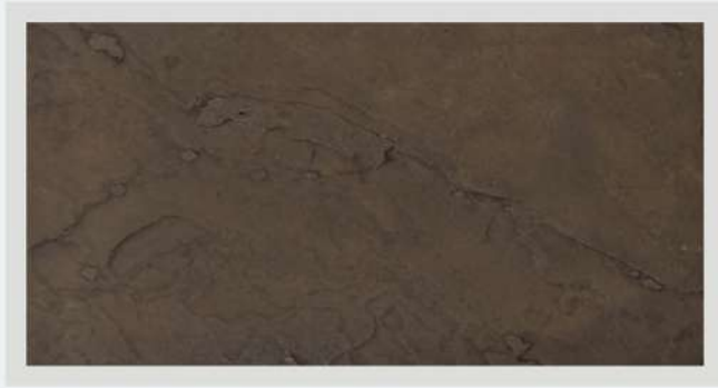
SS08 - SAND STONE