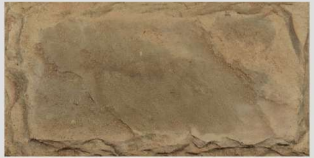
CR03 - CASTLE ROCK