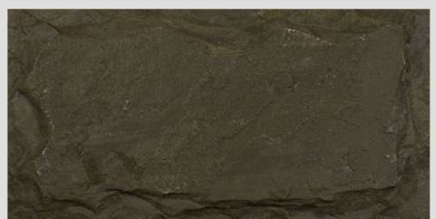
CR15 - CASTLE ROCK