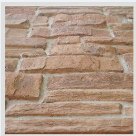
CY05 - CYPRESS LEDGE