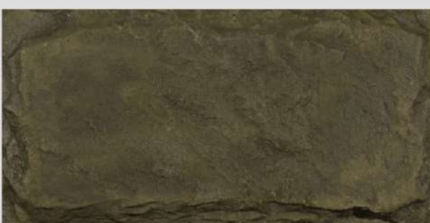
CR14 - CASTLE ROCK