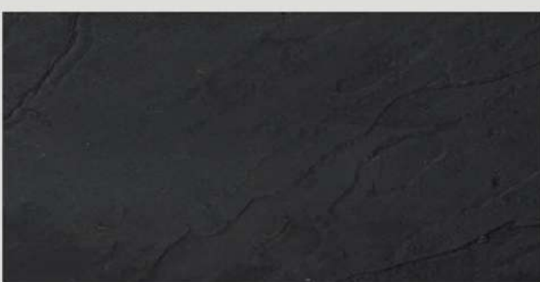
SS27 - SAND STONE