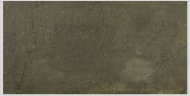
SS20 - SAND STONE