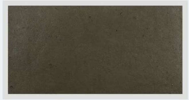
SB23 - SAND BLAST