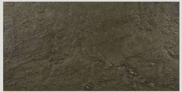
SS22 - SAND STONE