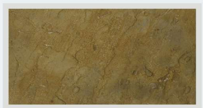
SS18 - SAND STONE