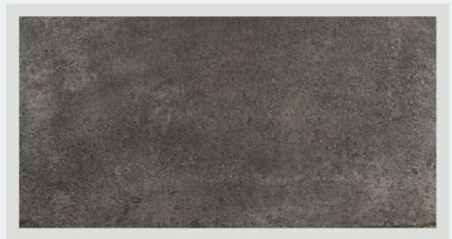
SB25 - SAND BLAST