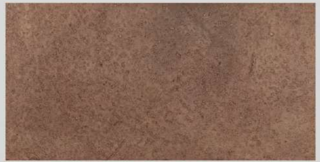
SB06 - SAND BLAST