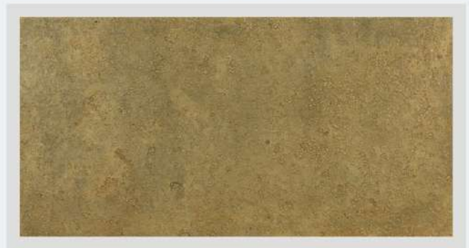
SB15 - SAND BLAST