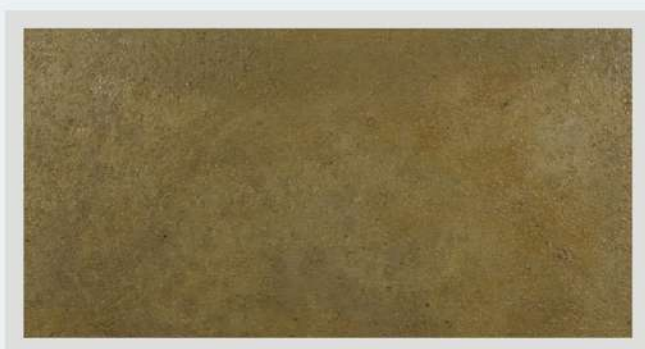
SB18 - SAND BLAST