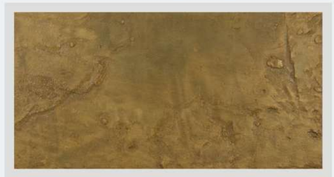
SS14 - SAND STONE