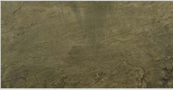
SS19 - SAND STONE