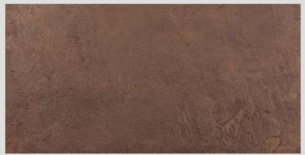
SS05 - SAND STONE