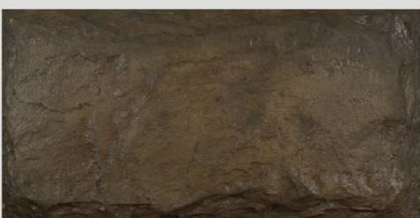
CR08 - CASTLE ROCK