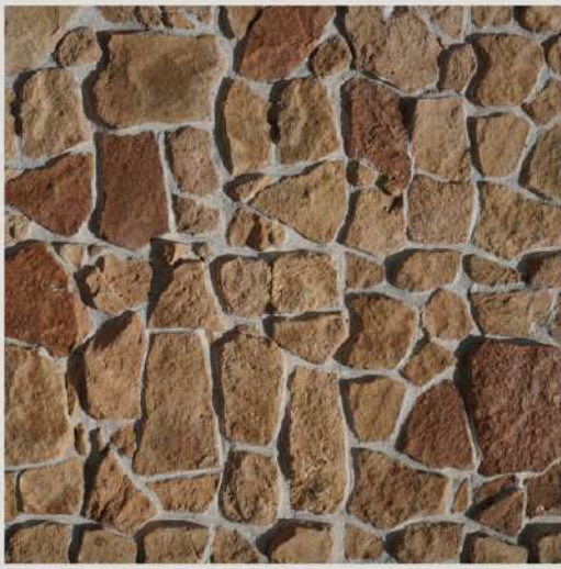
FS01 - FIELD STONE

FIELD STONE : Textures and colors of field stone look like they were pull straight from the country side.This is because of dedicated hard work of our artists make it natural organic shape and colors.