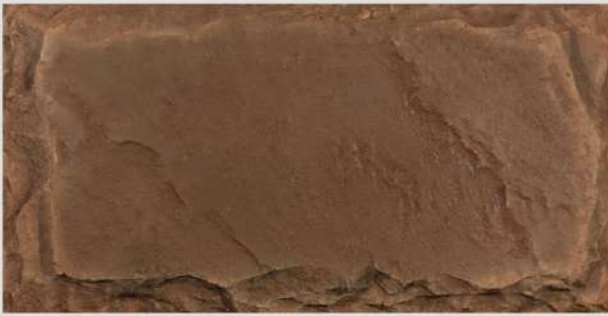
CR02 - CASTLE ROCK