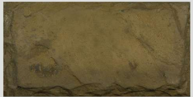
CR13 - CASTLE ROCK