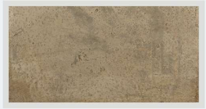
SB13 - SAND BLAST