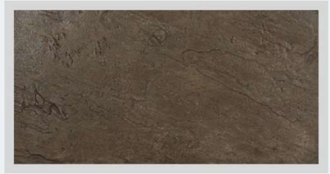
SS09 - SAND STONE