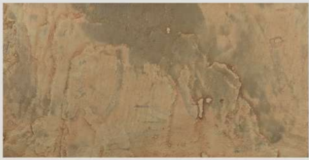
SS02 - SAND STONE