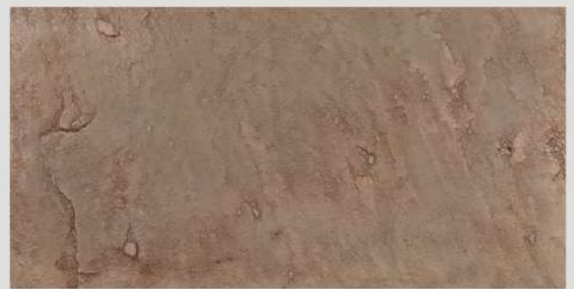
SS07 - SAND STONE