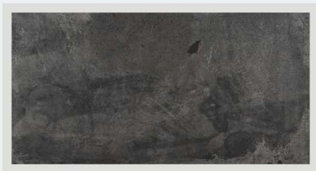
SB26 - SAND BLAST