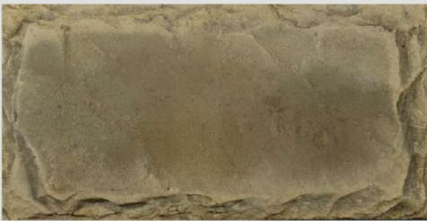
CR12 - CASTLE ROCK