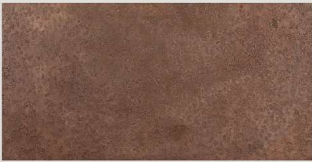
SB05 - SAND BLAST