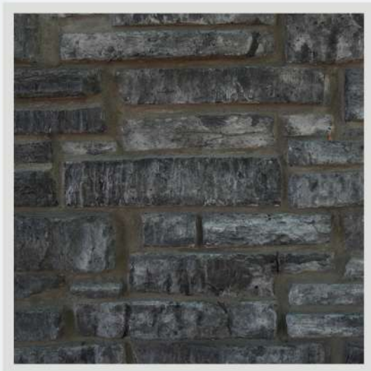
CY03 - CYPRESS LEDGE