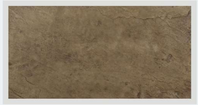
SS12 - SAND STONE