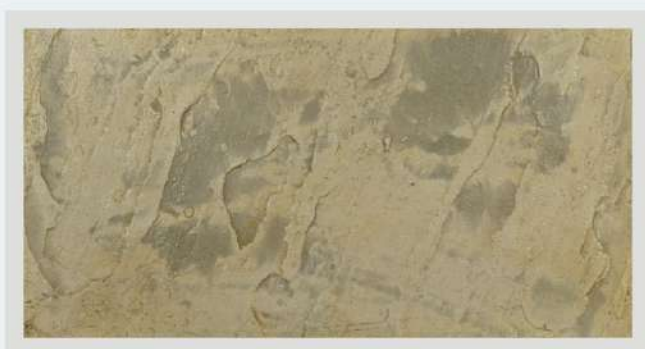
SS17 - SAND STONE