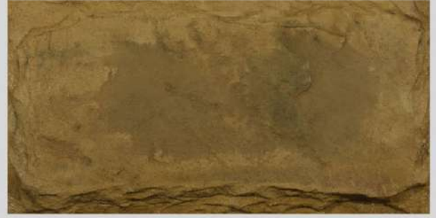
CR11 - CASTLE ROCK