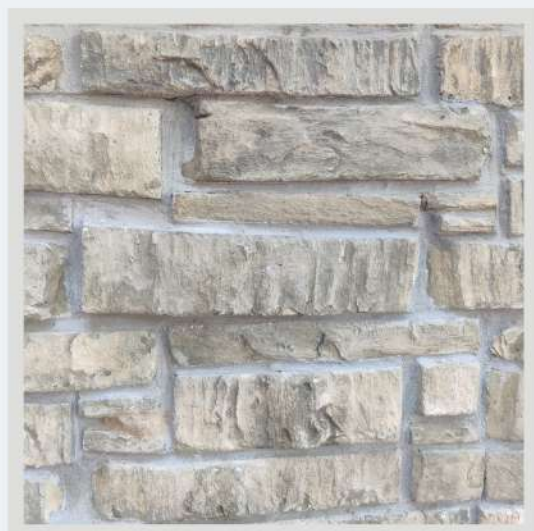
CY06 - CYPRESS LEDGE