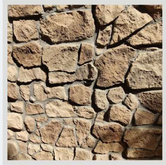
FS08 - FIELD STONE