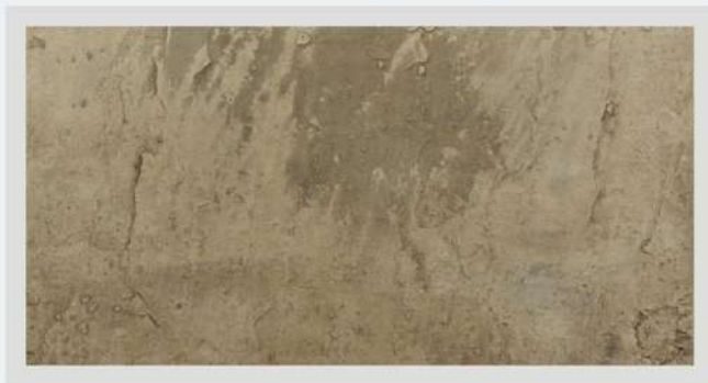
SS13 - SAND STONE