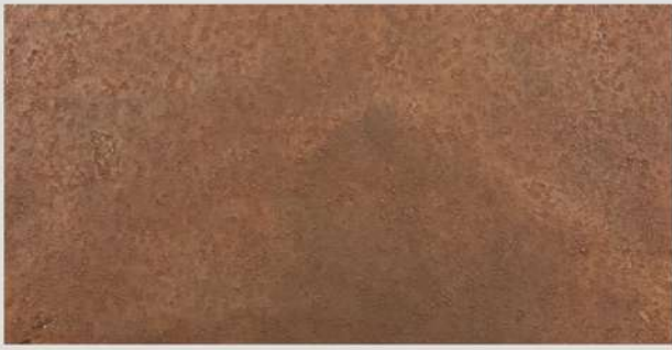
SB01 - SAND BLAST

SAND BLAST STONE : fabulous sandblasted engined concrete stone are extremely versatile and come in a variety of deferent colours.