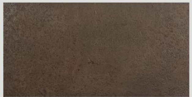
SB08 - SAND BLAST