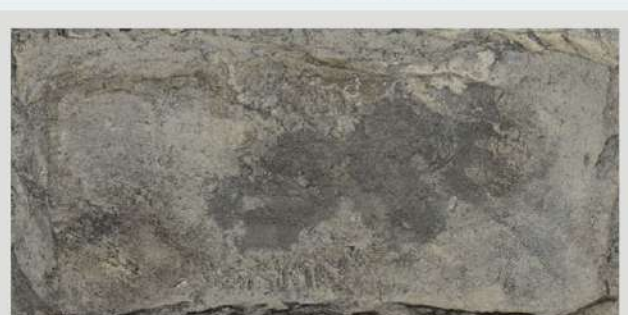
CR19 - CASTLE ROCK