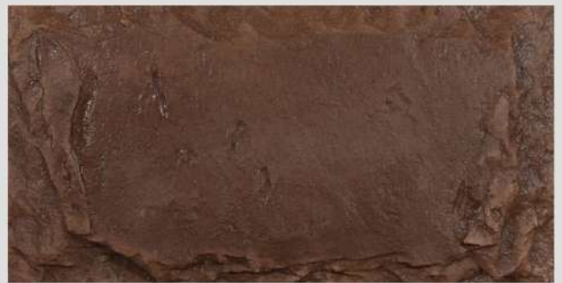
CR05 - CASTLE ROCK