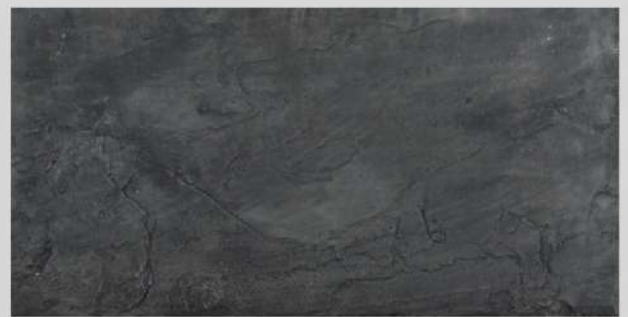
SS26 - SAND STONE