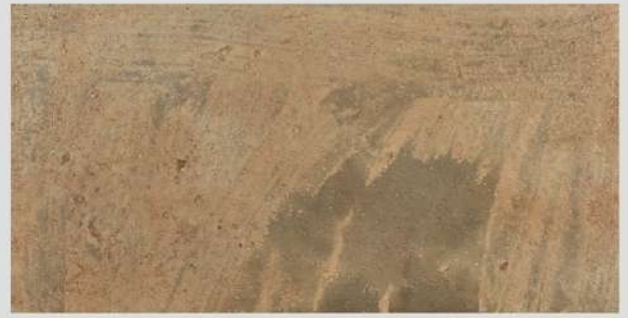
SB02 - SAND BLAST