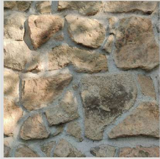
FS02 - FIELD STONE