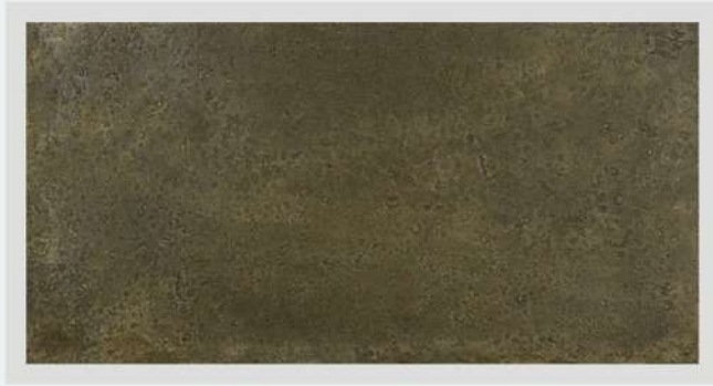
SB20 - SAND BLAST