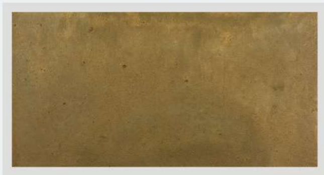
SB14 - SAND BLAST