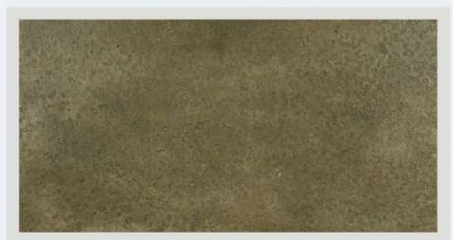
SB19 - SAND BLAST