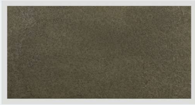
SB22 - SAND BLAST