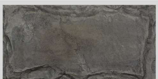
CR17 - CASTLE ROCK