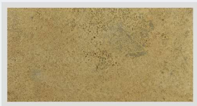
SB16 - SAND BLAST